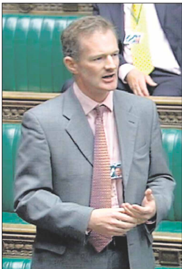
■ John Penrose MP campaigning in Parliament for more rail carriages

"We have to do more to increase the size and frequency of our local trains, so people can see they're getting value for money and that there's a decent alternative to taking the car on the M5 into Bristol each day."