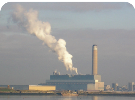
Kingsnorth Power Station dominates river views

Medway Council has approved the planning application to replace the coal fired Power Station at Kingsnorth. Refusal would have automatically led to a public enquiry. I have taken a considerable interest in this matter and have been in contact with the applicant company (E-ON), the Secretary of State, the council and objectors, notably Greenpeace.