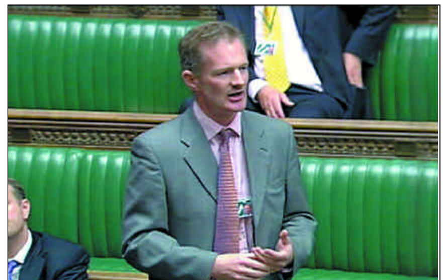
Over 1200 local innocent children are on the DNA database

"I am particularly concerned about the retention of children's DNA. What happens if computer hackers steal the information and use it for identity theft? Or if someone gains access to