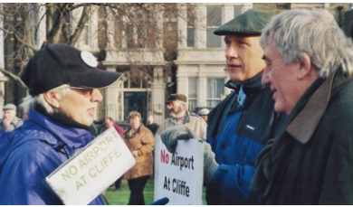
Meeting protestors in Rochester