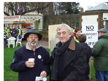
With a resident prior to the Rochester March