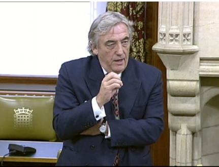
Speaking against the proposed airport during the Westminster Hall debate in Parliament