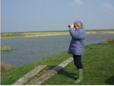
On Cliffe Marshes - This is what we could have lost

Update from Bob Marshall-Andrews – Member of Parliament for Medway