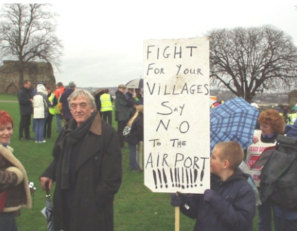
In the Castle Grounds prior to the Rochester March