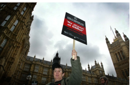
The successful RSPB lobby of Parliament, at which I spoke

Dear Resident I am delighted to report that the Government has now decided finally and without qualification to reject the concept of an airport at Cliffe. I have always asked for the earliest notification from ministers and this has been achieved. This represents a huge and significant victory for community and environmental organisations and for thousands of local people who have campaigned long and hard for this result. I feel extremely proud to have worked alongside so many of my constituents and to have ensured that the Government never underestimated our collective strength and determination. I am especially pleased that this campaign has been free from party politics... we have all pulled together regardless of our political differences and proved what can be done in these circumstances when everyone is under threat. We may even have achieved something that goes beyond victory. It was inevitable that any consultation should include a coastal site (as formerly with Maplin Sands) but the campaign has given us the opportunity to demonstrate the unique values of both our communities and our environment. This will undoubtedly ensure far greater protection from future development and the creation of a National Park.