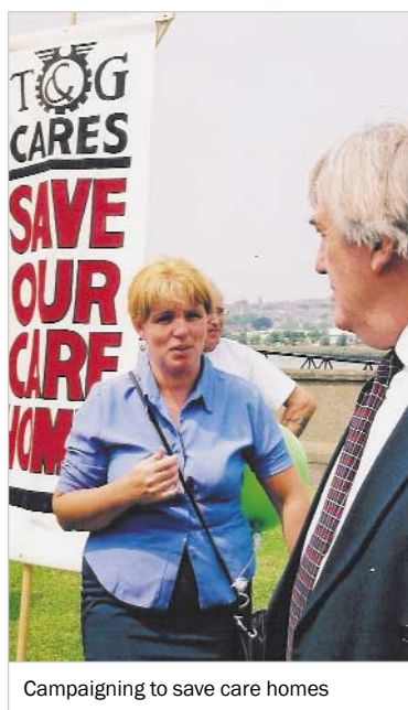
Campaigning to save care homes

The council has now voted to keep the homes open and back plans, put forward by Labour councillors, to invest in services for older people. These plans have been drawn up with the support of staff, trade unions, relatives, day users and residents.