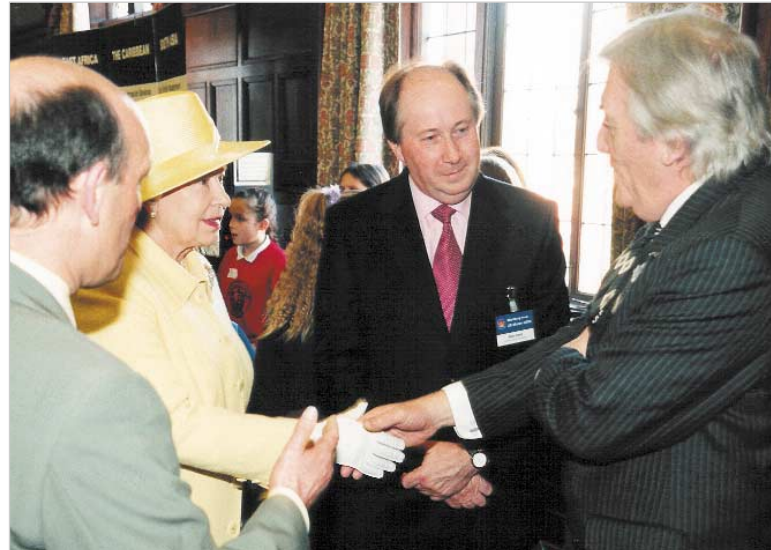
Meeting the Queen during her recent visit to the University campus at Chatham Maritime

The whole 'Universities at Medway' project is a flagship example of Government commitment to education. It has been kick-started thanks to £4million worth of government money from the Higher