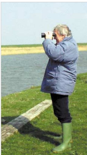
A recent trip to Cliffe Marshes

A leaked proposal for a new international airport at Cliffe has ruffled many feathers locally – mine included – as the area is a vital haven for bird and other wildlife.