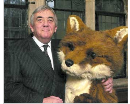
In the recent free vote I voted for a total ban on hunting with dogs

Whether on a national or local level, I have continued to uphold the principle that the job of a Member