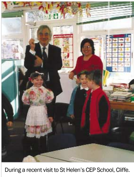
During a recent visit to St Helen's CEP School, Cliffe.

Since the election in June 2001, parliamentary demands have been particularly heavy on all Members of Parliament. Domestic politics have, of course, been overshadowed by the atrocities committed on the 11 September, 2001, in America. The subsequent actions which have been taken by America, Britain and other countries, have been the subject of parliamentary scrutiny and five full debates. I have attended all of these debates and have contributed to them. The Prime Minister has repeatedly, and rightly, drawn the connection between the coalition against international terrorism and the necessity for international justice, particularly in the case of the Palestinian Arabs. The solution to this terrible conflict in the Middle East must be the first and