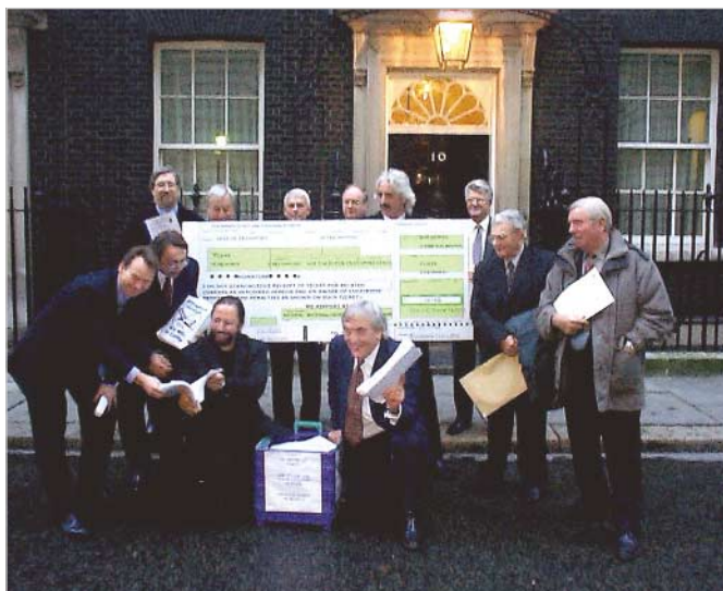
Outside 10 Downing Street, with representatives of the local Parish Councils, during the handing in of residents letters and petitions against the Airport

Most important I continue to speak to and correspond with the many local people who are deeply worried by this proposal. To date I have answered over 2,500 letters on the issue. I have also attended public meetings and co-hosted a Westminster lobby.